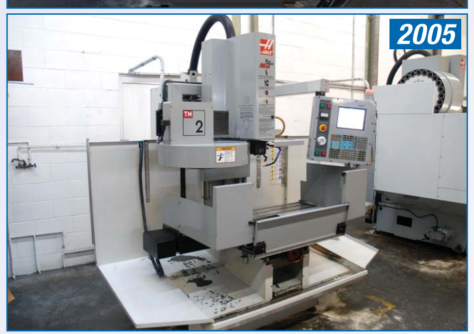
HAAS Toolroom Mill, Model TM-2, Travels: X-30", Y-12", Z-16", Table Size 57.7" x 10.5", 4,000 RPM, 40 Taper, 20 ATC, Rapid Feed X,Y,Z 200 IPM, Spindle Nose To Table Range 4" – 20", 7.56 HP, 240 V, sn 43942