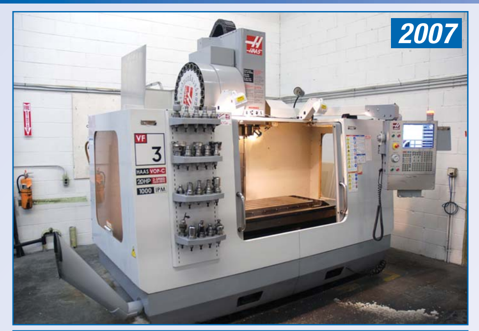
HAAS VF-3B, VOPC, Travels: X-40", Y-20", Z-25", Table Size 48"x18", 8,000 RPM, 40 Taper, 24 ATC Sidemount, 2 Speed, Rapid Feed X,Y,Z: 1,000 IPM, Spindle Nose To Table Range 4"-29", Programmable Coolant, 20 HP, Chip Auger, Lights, 230 V, sn 1058211