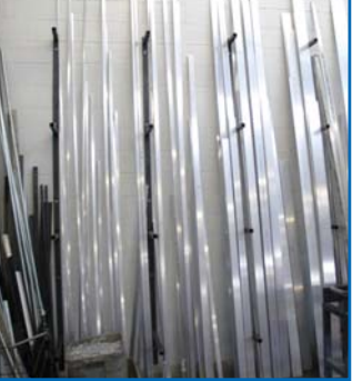
PARTIAL VIEW OF ALUMINUM RAW MATERIAL