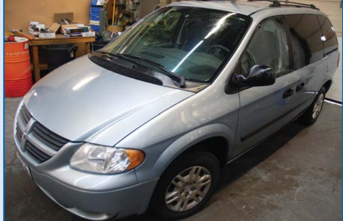
DODGE CARAVAN MINIVAN